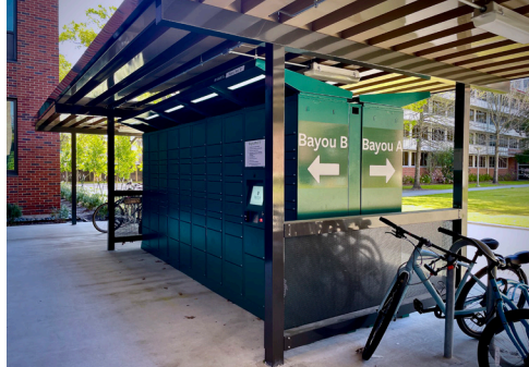
Lockers located near Bayou Residence Hall.

Please be sure that anything sent to you has your first and last name and mail code in the address. Items missing this information will be subject to delays in availability.