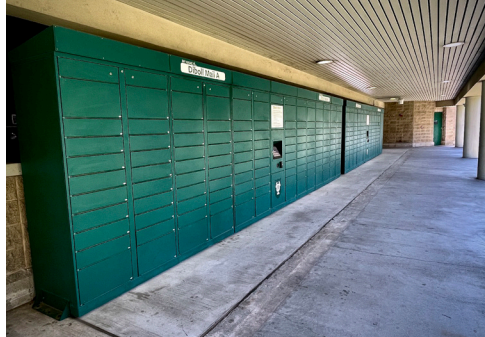
Lockers located at Diboll Complex.