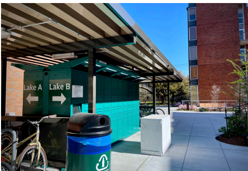
Lockers located behind Lake Residence Hall.